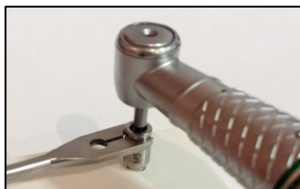
6- Insert the drill directly into the centering guide with the contra-angle.