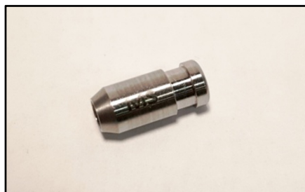
2- Select the centring guide according to the connection and platform.