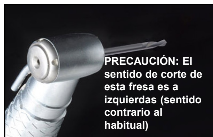
5- Place the drill in the contra-angle.