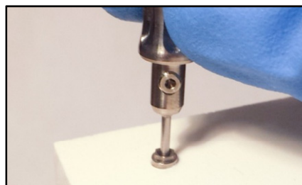
9- Insert the punch into the shank.