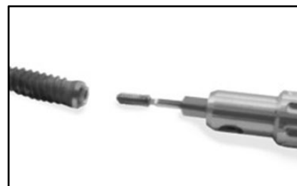
11- Remove the shank.