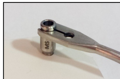
3- Place the centering guide over the implant using the wrench.