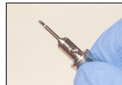
8- Select the extraction punch.