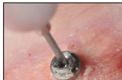
7- Remove the guide and drill the shank with the contra-angle.