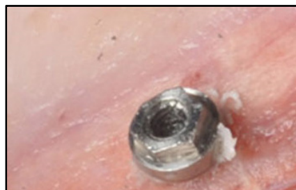
1- Visualize the embedded broken shank.